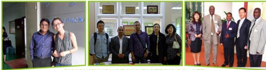
SHAANXI HONGBAIYI BIOTECH CO., LTD.